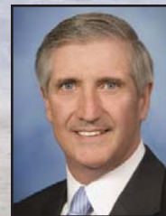
ANDREW H. CARD Former U.S. Transportation Secretary and White House Chief of Staff