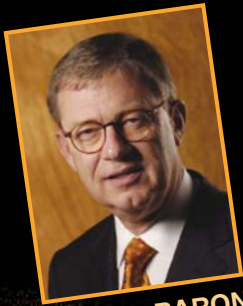
MICHAEL BARONE Political Columnist & Senior Writer U.S. News & World Report Washington, DC