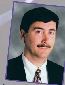
LARRY SABATO Political Analyst, Author & Professor University of Virginia Charlottesville, VA